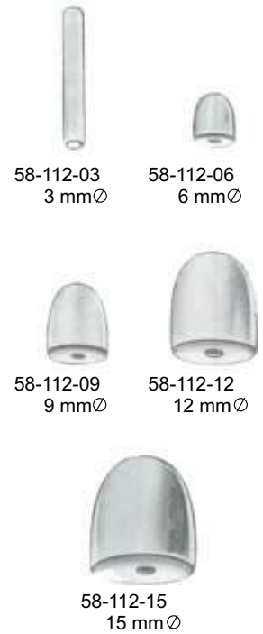
58-112-03 3 mm Ø