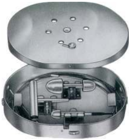
Nabatoff 58-112-00 135x100x25 mm