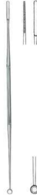
Jobson-Horne 58-080-13 13 cm/5" 58-080-18 18 cm/7"